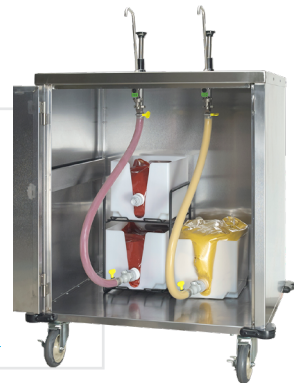
Remote Dispensing System

The Remote Dispensing System simplifies high-volume dispensing of condiments directly from a manufacturer's pouch with fitment without the hassles of CO 2 .